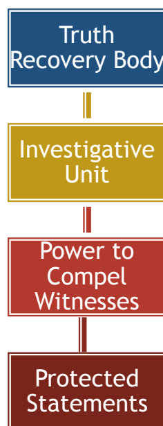
Figure 2: Truth Recovery and Use Immunity

Figure 2 illustrates the structure of this model.